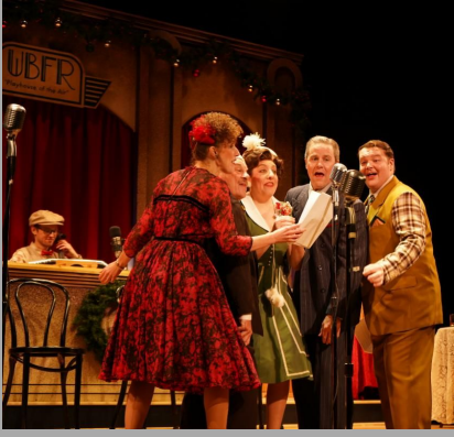
Photo from TAP's 2022 Production of A Christmas Carol: A Live Radio Play

What are the largest challenges of directing this play? It's A Wonderful Life is one of the best known, and beloved holiday films of all time, so our audience will come with all sorts of expectations about the show. Making sure that we honor the story is our primary task, which means we dive deep on the characters and what makes them tick.